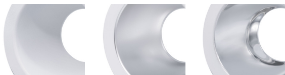
WHT-AM White Matte